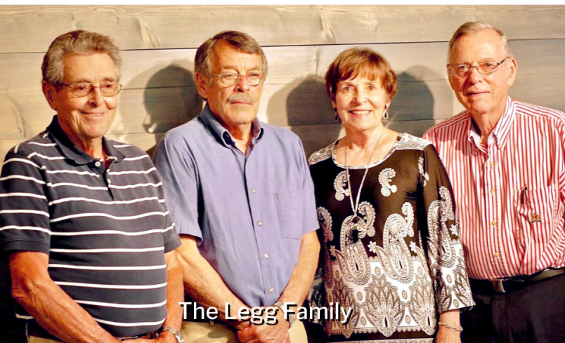
The Legg Family